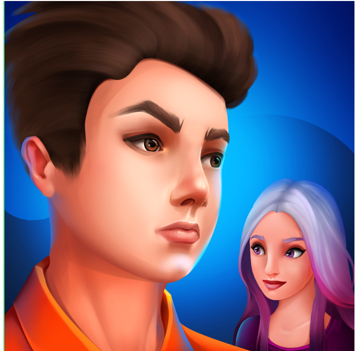
Escape Code - Coding Adventure